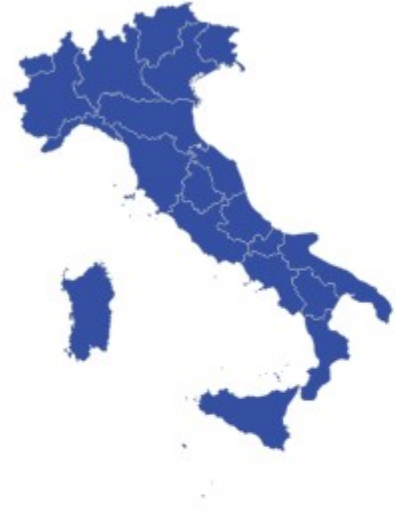
Actual load per bidding-zone [GWh]